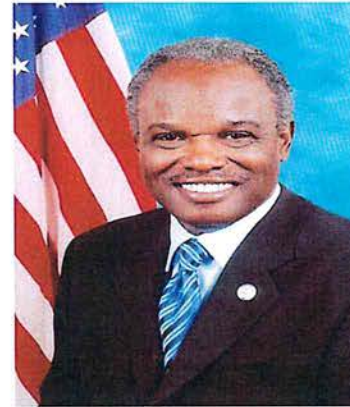
Ranking Member David Scott (D – GA)