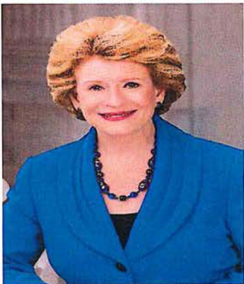
Chairwoman Debbie Stabenow (D – MI)