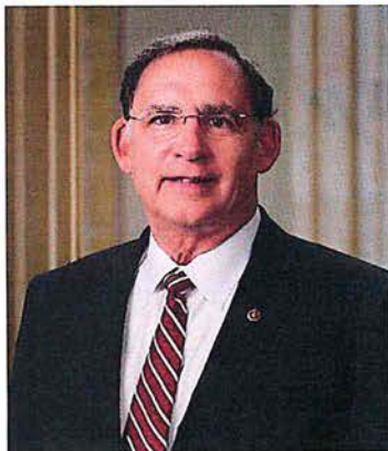
Ranking Member John Boozman (R – AR)