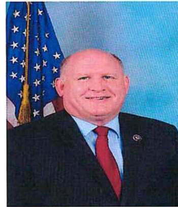
Chairman “GT” Thompson (R – PA)