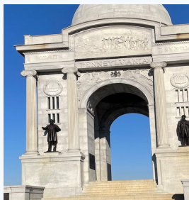
Pennsylvania Monument in Gettysburg.

We are blessed to be able to live and farm in a country where we are safe and free.