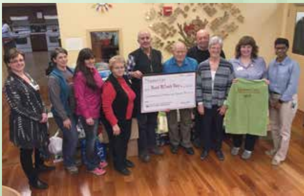
Farmers Care Program check donation presentation at Pittsburgh Ronald McDonald House.

This yearly program recognizes that "Farmers Care", and want to give back to the local community. Charitable donations of food and money are collected for regional Ronald McDonald Houses and community food pantries.