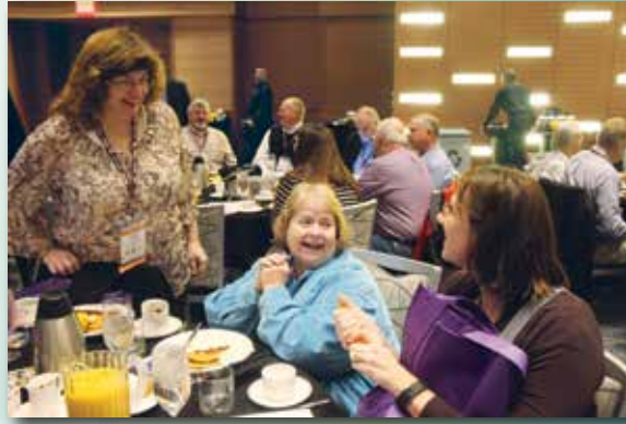
Representing Pennsylvania Farm Bureau at American Farm Bureau Federation Annual Meeting

*If a county does not wish to have a WLC, it may organize a Leadership (LDC) comprised of men and women.