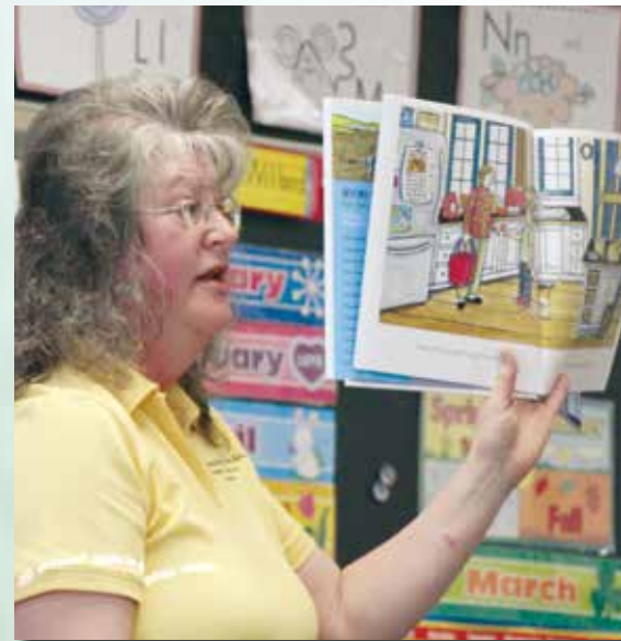
Presenting FARM-tastic Book Program to school children

The Women's Leadership Committee encourages involvement, advocates for Pennsylvania Farm Bureau membership, and strives to learn more about agriculture through networking and outreach.