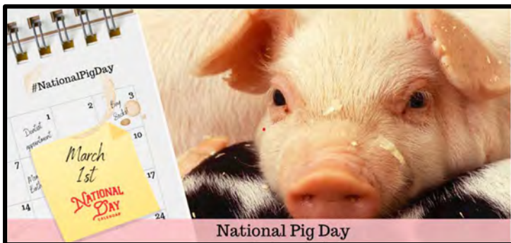
National Pig Day