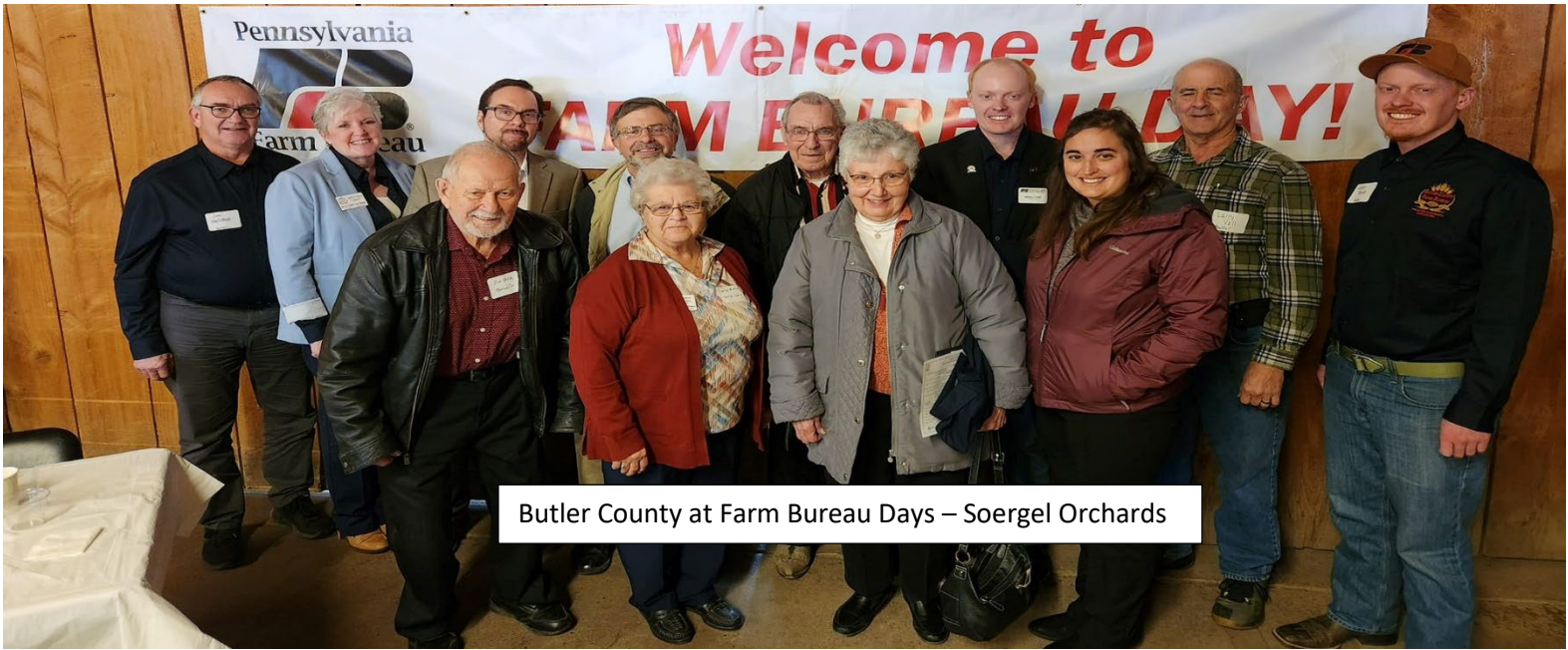
Butler County at Farm Bureau Days – Soergel Orchards