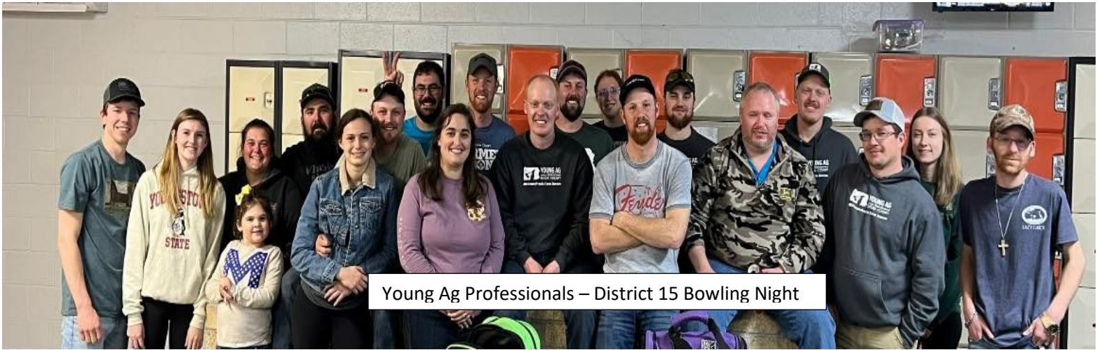
Young Ag Professionals – District 15 Bowling Night