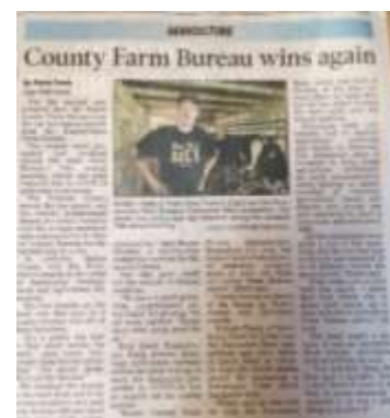
County Farm Bureau Wins Again Nov. 25, 2020