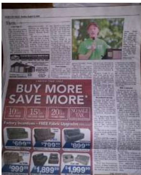
Farm Issues Focus on Legislative Tour Aug. 23, 2020