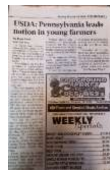
USDA: PA Leads Nation in Young Farmers Oct. 25, 2020