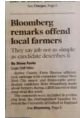
Bloomberg remarks offend local Farmers Feb. 19, 2020