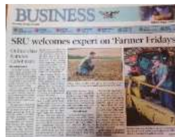
SRU Welcomes Expert Oct. 15, 2020