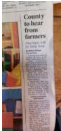
County to hear from Farmers Feb. 13, 2020