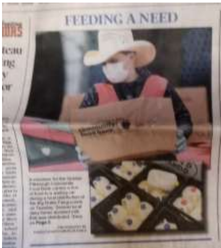
Feeding a Need – Milk Drive April 29, 2020