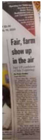
Fair, Farm Show up in the Air April 19, 2020