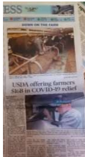
Down on the Farm May 31, 2020