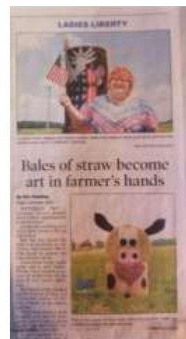
Ladies Liberty July 13, 2020