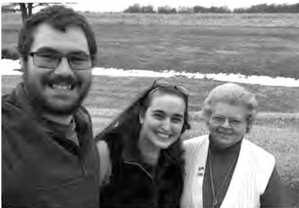
Ag Promotion Conference in State College. The conference focused on how to make videos and tips for posting on social media platforms. March 9, 2019