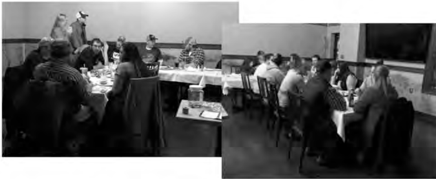
Spring Annual Meeting –YAP Committee March 19, 2019