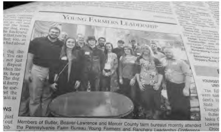
YAP in the Butler Eagle. This article features District 15 YAP, which includes (Butler, Beaver/Lawrence, & Mercer) 13 members attending state leadership conference.