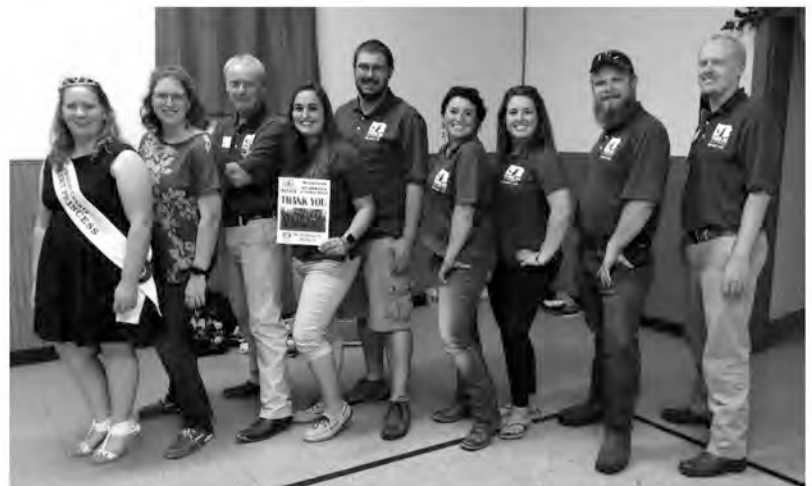
July 20-21, 2019 Fall Meeting – YAP Committee