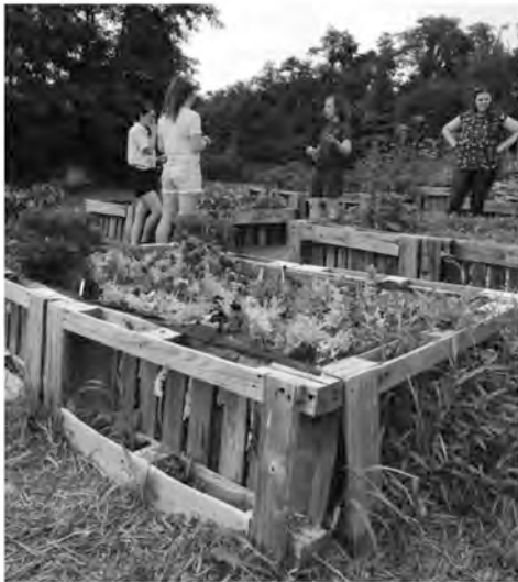
July 20-21, 2019 State YAP Summer Picnic Washington County – Food Bank & Tour of Three D. Ranch