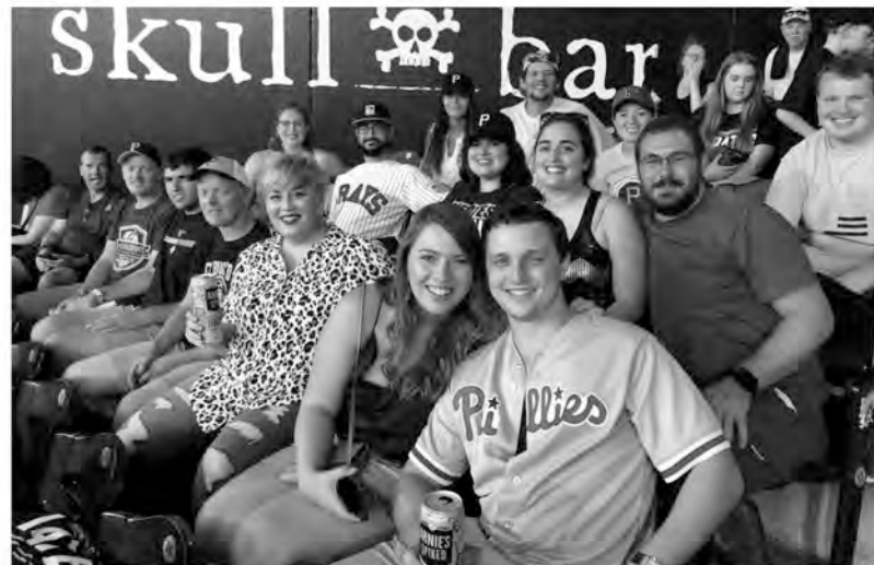
August 2 2019