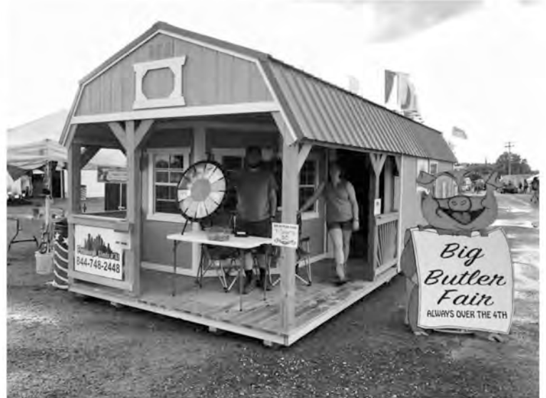
July 2019 Big Butler Fair YAP promoting agriculture at the fair