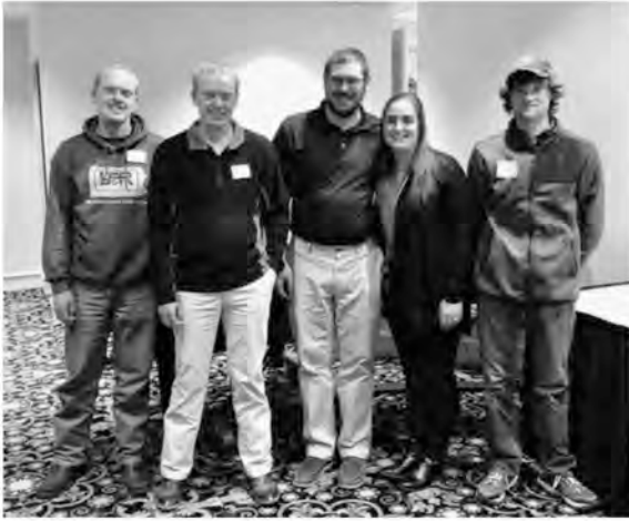
PA State Leadership Conference, State College, PA Jan. 26 & 27, 2019