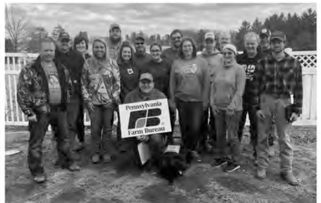
The Western PA - District 15, 14, 16, & 13 attended the YAP Kick Off Meeting! This meeting included planning for events, districts, & activities this year. Speer House, March 10, 2019