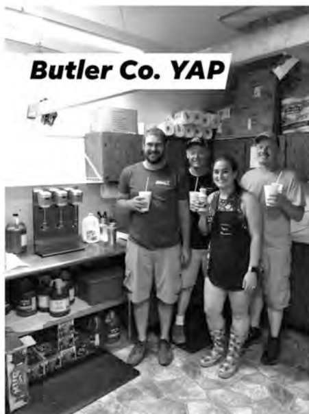
Butler Co. YAP committee members volunteering at dairy promotion booth