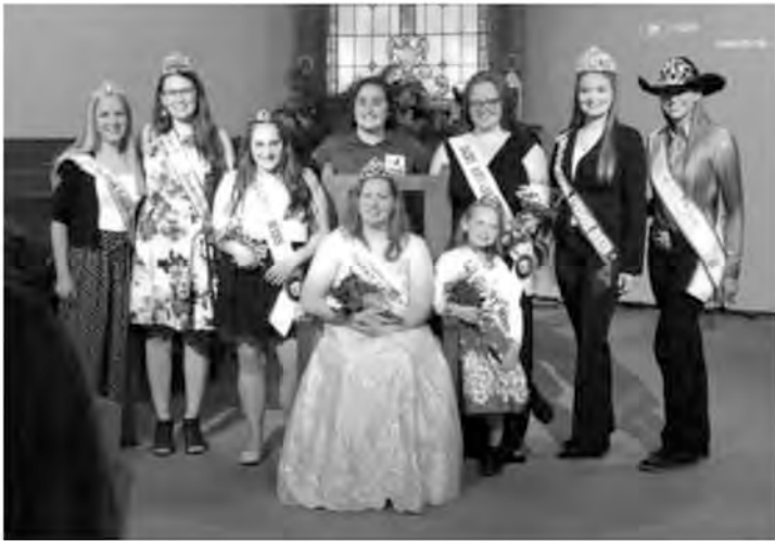
Butler Co. Dairy Princess Pageant June 13, 2019