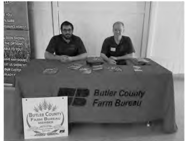
Western PA Regional Soil Health Workshop Butler, PA March 7, 2019.