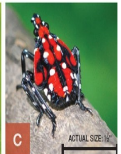
PA Department of Agriculture