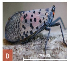
PA Department of Agriculture