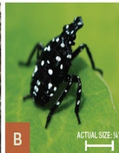
PA Department of Agriculture