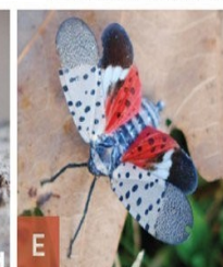
PA Department of Agriculture